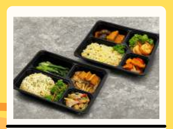
A bento similar to what we ate -person who did layout

On the final day, we even got to eat lunch together in our classroom. Although we couldn't walk about and talk to one another, the whole experience still felt very fulfilling. We knew that over the 3 days of the camp, we all took an important part of the lessons home.